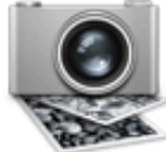
Image Capture Plugin